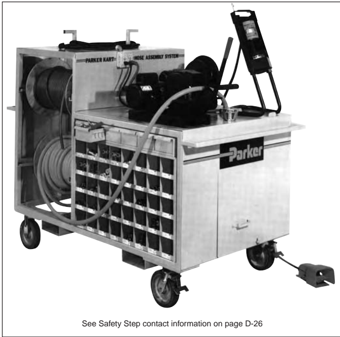
See Safety Step contact information on page D-26