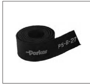
Partek "PS" Sleeve