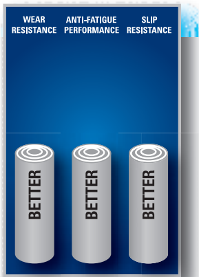
RESULTS from INDEPENDENT TEST LABS & PRESENTED as COMPARISONS to OTHER NoTRAX® FOOD SERVICE MATS