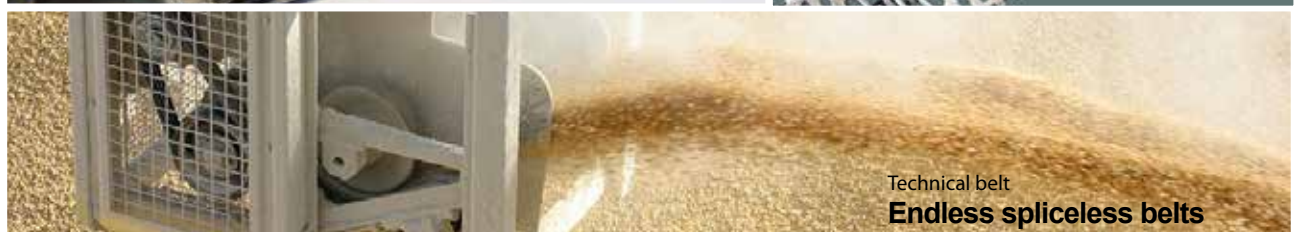
Technical belt Endless spliceless belts