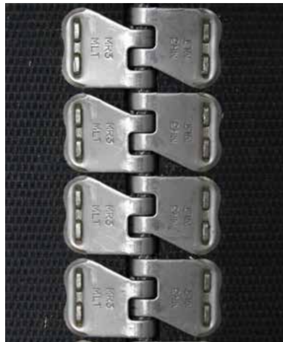
Mini Record Fastener - Top plate