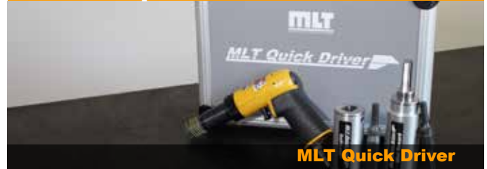
MLT Quick Driver