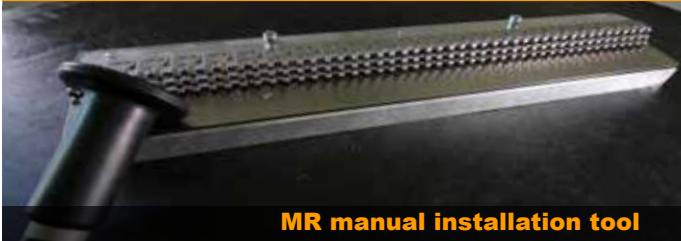
MR manual installation tool