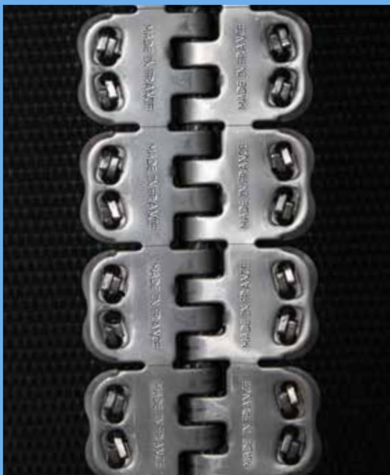
Mini Record Fastener - Bottom plate