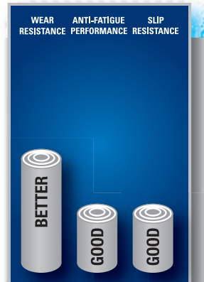
RESULTS from INDEPENDENT TEST LABS & PRESENTED as COMPARISONS to OTHER NoTRAX® SPECIALTY MATS