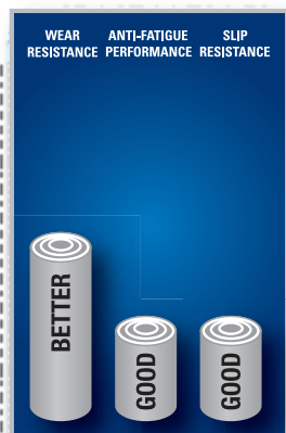
RESULTS from INDEPENDENT TEST LABS & PRESENTED as COMPARISONS to OTHER NoTRAX® SPECIALTY MATS