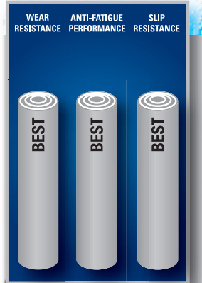
RESULTS from INDEPENDENT TEST LABS & PRESENTED as COMPARISONS to OTHER NoTRAX® FOOD SERVICE MATS