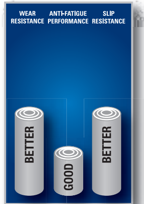
RESULTS from INDEPENDENT TEST LABS & PRESENTED as COMPARISONS to OTHER NoTRAX® INDUSTRIAL MATS