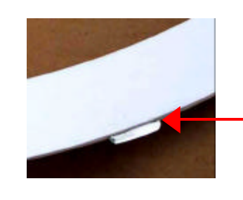
316ss tabs secure the gasket into the Cover Groove to prevent the gasket from falling out.