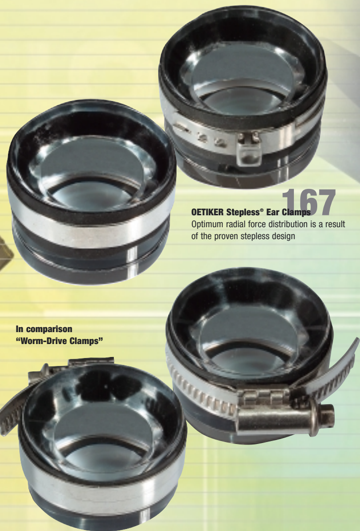
OETIKER Stepless® Ear Clamps Optimum radial force distribution is a result of the proven stepless design