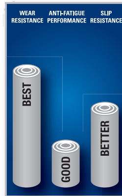
RESULTS FROM INDEPENDENT TEST LABS & PRESENTED AS COMPARISONS TO OTHER NoTRAX® INDUSTRIAL MATS