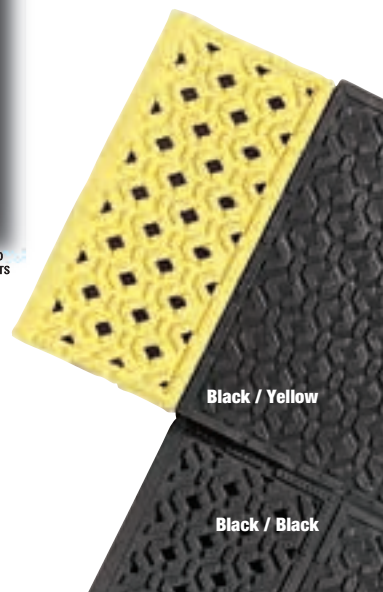
Black / Yellow

RESULTS from INDEPENDENT TEST LABS & PRESENTED as COMPARISONS to OTHER NoTRAX® INDUSTRIAL MATS