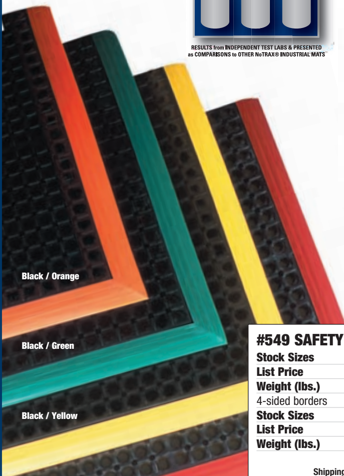
Black / Orange