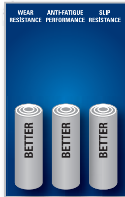
RESULTS from INDEPENDENT TEST LABS & PRESENTED as COMPARISONS to OTHER NoTRAX® INDUSTRIAL MATS