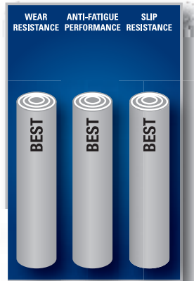
RESULTS from INDEPENDENT TEST LABS & PRESENTED COMPARISONS to OTHER NOTRAX® INDUSTRIAL MATS