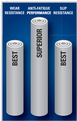
RESULTS from INDEPENDENT TEST LABS & PRESENTED as COMPARISONS to OTHER NOTRAX® INDUSTRIAL MATS