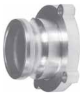
6000-16 6000-17 Male