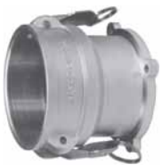
6000-14 6000-15 Female