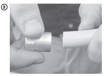
Install ferrule by slipping it onto the end of the hose and twisting it counter-clockwise.