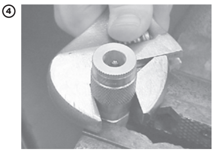
Turn the reuseable fitting into the ferrule until coupling is seated against ferrule.