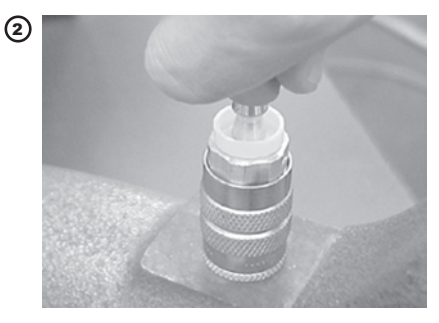
Place the end of the fitting against a flat object and grip the hose one inch from end. Push with a steady force until end of hose is covered by yellow plastic cap.