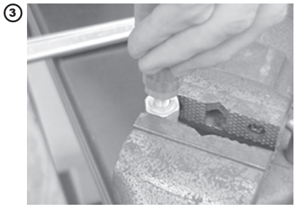
Apply lubricant sparingly to the reusable barb before inserting it into the ferrule.