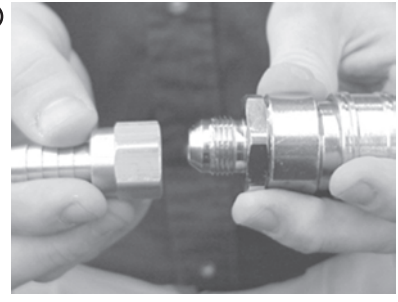
Lightly lubricate the flare on the adapter and thread it into the coupling. Hand-tighten, ensuring that the flare is seated correctly during installation.