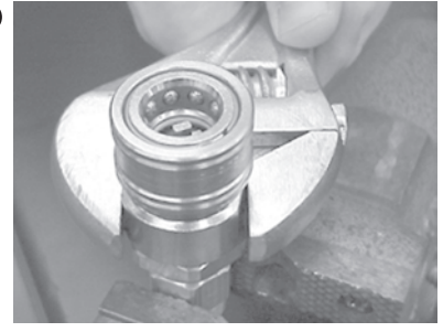
Wrench tighten the connection to the appropriate torque specification, as shown in the chart below.