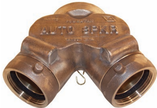
21-132 "Y" type - (back outlet)