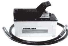
air/hydraulic foot pump