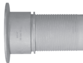
Notched Turned Back Nipples

Note: Stems are for use with Lap Joint Flanges on page 461