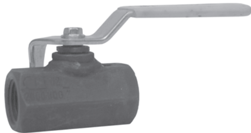
Female NPT x Female NPT