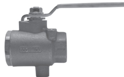
Female NPT x Female NPT