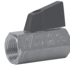
Female NPT x Female NPT