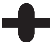
Type 1 - Standard 1" - 8"