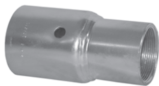
1 1/4" - 2"