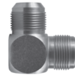
90° Male x Male