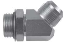
45° Male x Male