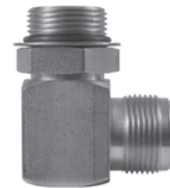
90° Male x Male