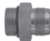
Male x Male