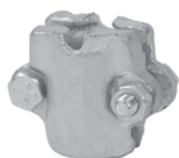
2-bolt Clamps for 1 Wire Hose