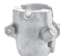
2-bolt Clamps for 2 Wire Hose