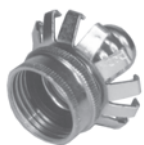
Female with Swivel Nut