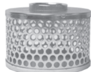
304 Stain. Steel Round Hole Type