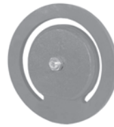
Flapper Valve Assembly