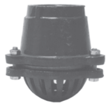
Complete Threaded Assembly (painted)

Must be installed in the vertical position