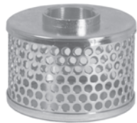
Standard Threaded Round Hole Type *