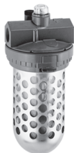
Jumbo Transparent 26 oz. Bowl with Guard