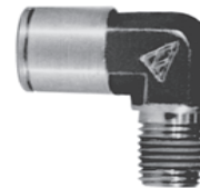
(Tube to Male NPTF)