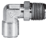
(Tube to Male NPTF)