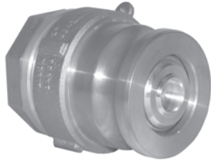
1½" - 2" adapter