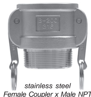
stainless steel Female Coupler x Male NPT