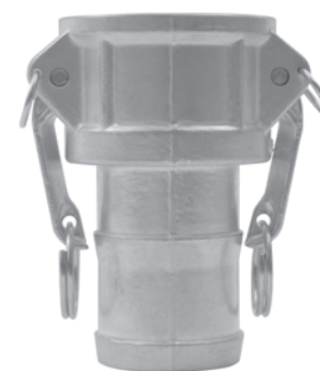
aluminum, brass Female Coupler x Hose Shank (not for use with Interlocking Crimp Ferrules)

* ¾" - 4" are A380 die cast aluminum 6" is 356T6 aluminum