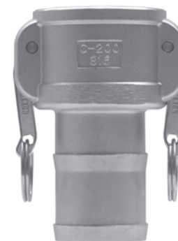
stainless steel Female Coupler x Hose Shank (not for use with Interlocking Crimp Ferrules)