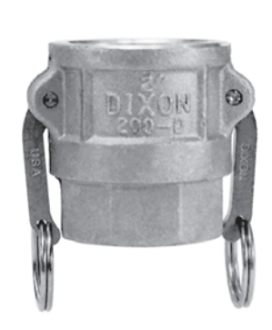
Female Coupler Female NPT