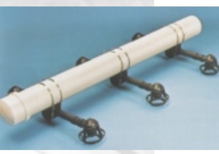
Cooling tower nozzles are clamped with BAND-IT band and buckle.

Components of an electrical array are identified with a variety of BAND-IT I.D. products including customized embossed tags, stainless steel embossed tape and high visibility EASY READ tags.